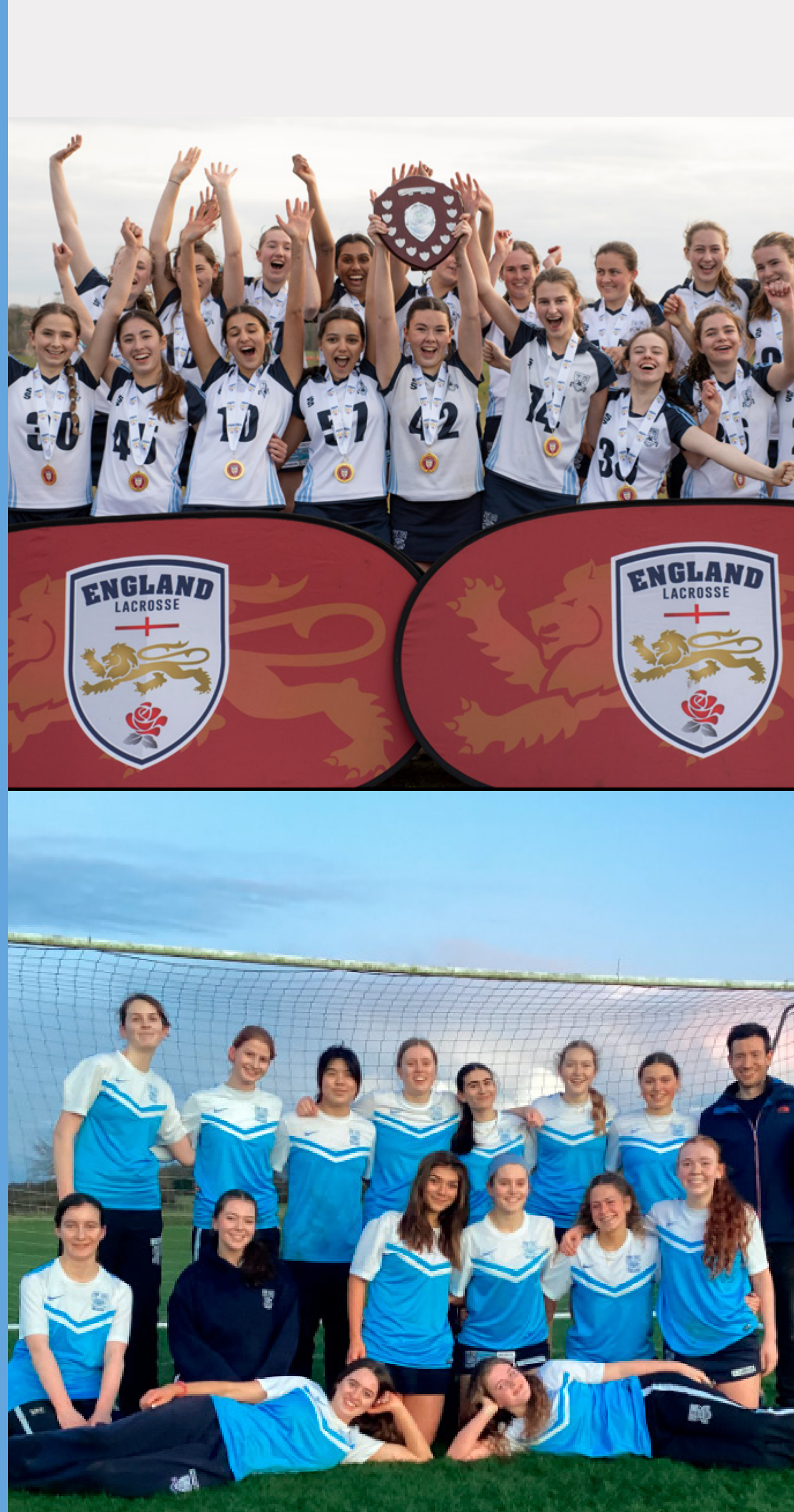
Options Booklet 2026-28